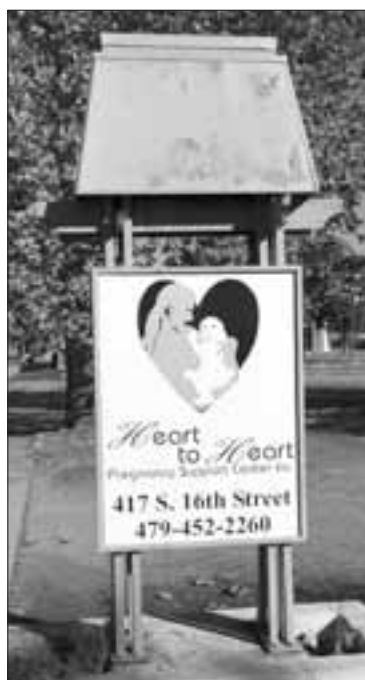
Heart to Heart in Fort Smith used CCHD grant money to help women in crisis pregnancies.

■ In Little Rock, a grant was awarded to the diocesan youth ministry office to help fund the annual Catholic Charities Summer Institute. This week-long summer camp hosted nearly 100 high school students and gave them an intense immersion into