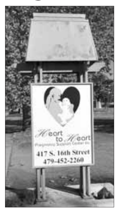
Heart to Heart in Fort Smith used CCHD grant money to help women in crisis pregnancies.

■ In Little Rock, a grant was awarded to the diocesan youth ministry office to help fund the annual Catholic Charities Summer Institute. This week-long summer camp hosted nearly 100 high school students and gave them an intense immersion into