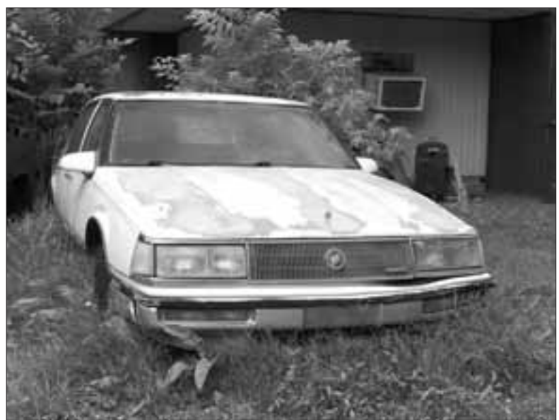
Have a vehicle that's old and in the way, running or not? Donate it to Catholic Charities of Arkansas and receive a tax deduction.

collection is used by the Social Action Office to support the CCHD local grant program. Pregnancy resource centers, food pantries, prison ministries and homeless