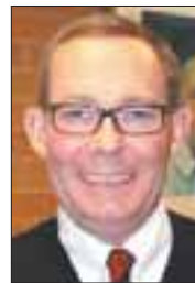
From the Director Patrick Gallaher

The U.S. Citizenship and Immigration Service began accepting DACA applications on Aug. 15. Immigration advocates predicted that as many as 250,000 applications would be filed immediately. The predictions failed to materialize as fact. In the first month, just over 82,000 applied. In the second month, the total number of applicants rose to nearly 180,000. At the end of the second month of processing, 4,591 cases had been approved.